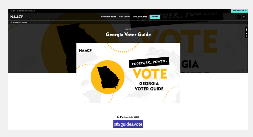
NAACP website reprinting our guides