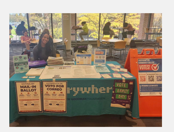
Northampton Community College Bethlehem PA 2023