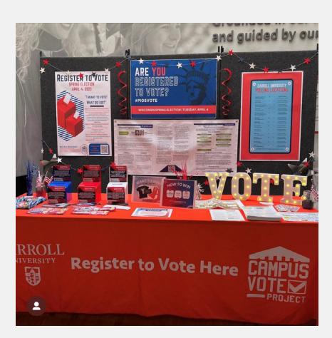
Banner and printed guides at Wisconsin's Carroll University